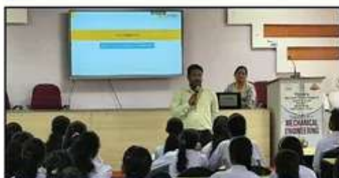
IBM Skill Build Training to all students