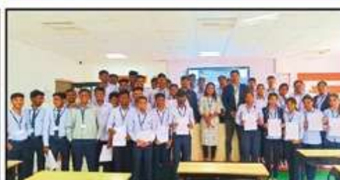
Bajaj Auto Ltd. Selected Students