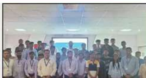
Subros Ltd. Selected Students