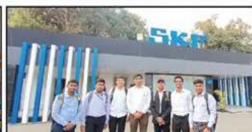
SKF Ltd. Selected Students

Survey No. 12/1/2 and 12/2/2, Behind Swaminarayan Temple, Narhe, Tal. Haveli, Pune – 411 041