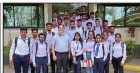
Industry Visit to Bobst India Pvt Ltd.