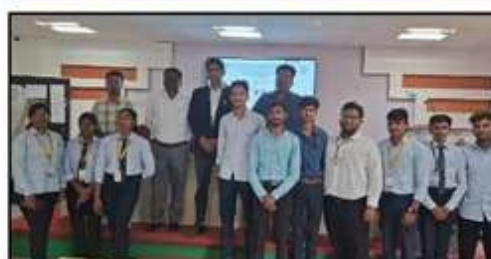
Dynamic Concrete Consultancy Selected Students