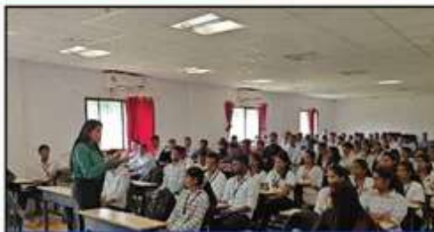
Personality Development & Interview Tricks Session