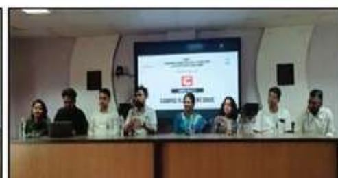
Cummins Preplacement Talk