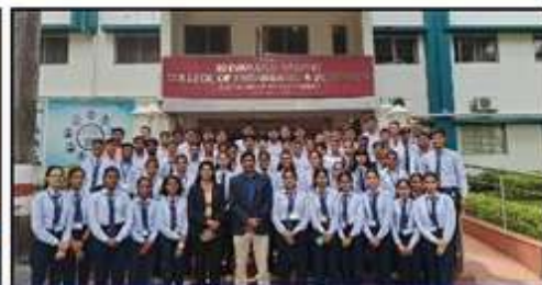
Barclay's Soft Skill Training Completed Students