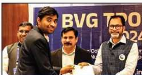
MOU With BVG India Ltd