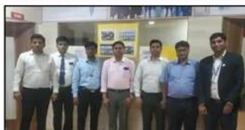
Kirloskar Brothers Ltd HR & Technical Interview Panelists