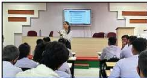
Resume Building Session