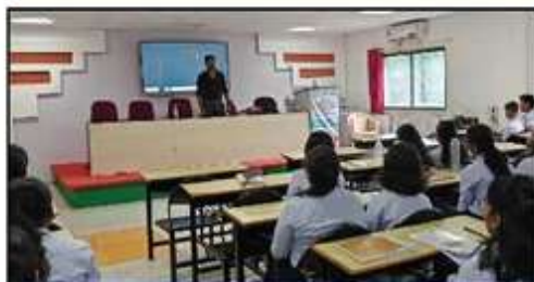
Aptitude Training Session