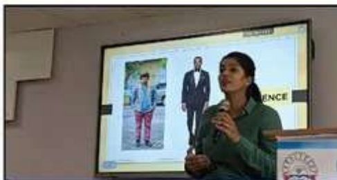
Dressing & Grooming session